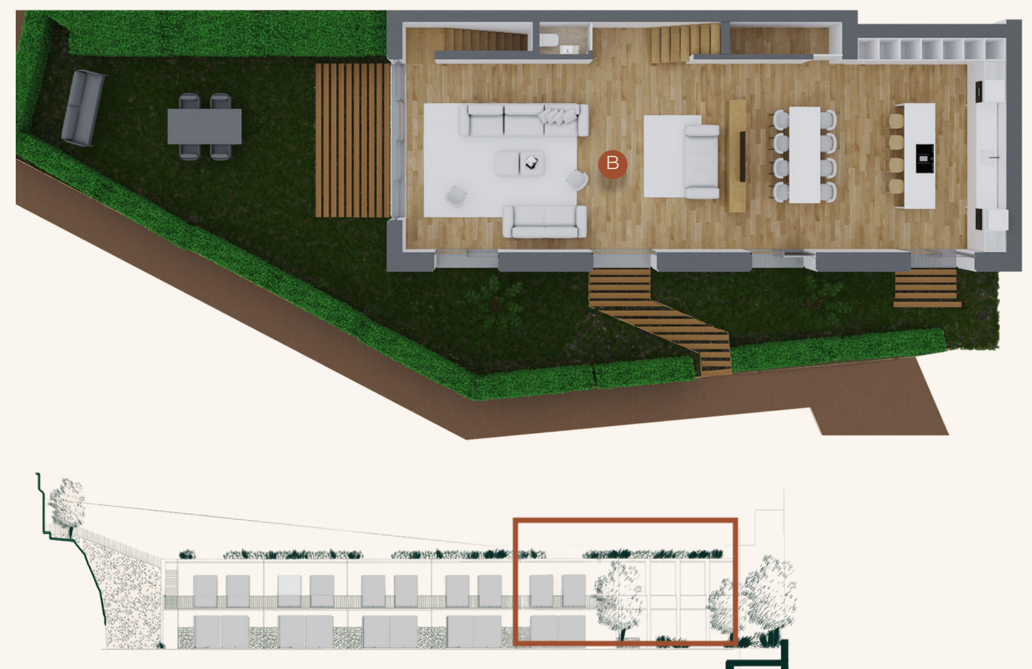
Image simulated for illustrative purposes and may be subject to change. The plans and respective dimensions may vary due to technical, structural requirements and/or at the request of the competent authorities.